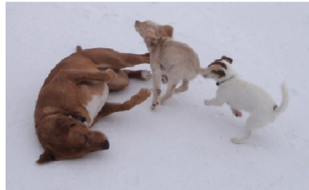
Little Mountain Park Outing, Nov. 9, 2008