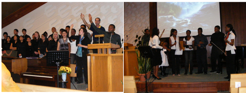
Won By One, Breath of Life, & S.M.A.R.T. Nov 7, 2008