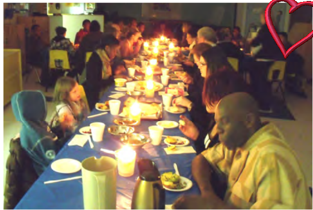
Agape Feast, January 1, 2010