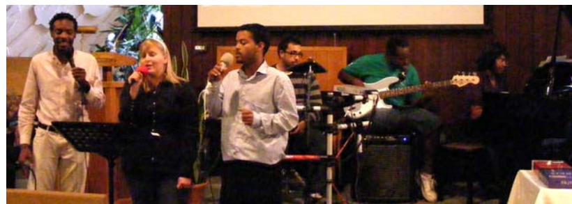
Praise Team, September 12, 2009